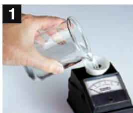
1 Rinse and fill cell cup