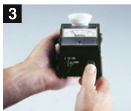
3 Push button to indicate reading