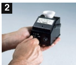
2 Select Conductivity/TDS range