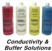
Conductivity & Buffer Solutions

Note: pH 7 Buffer is especially important and should be used every 1-2 weeks.