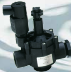
024-1 Solenoid Valve